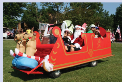
Most Creative 2nd Place The Hughett Family Unit #77-4