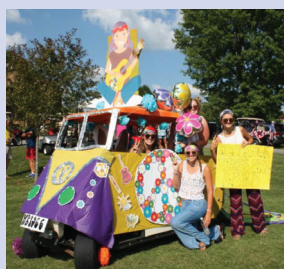
Woodson Bendiest 2nd Place The Brokamp Family Unit #36-2