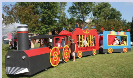
Most Creative 1st Place Keckeis Family Unit #79-1/2