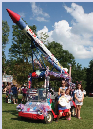
Most Patriotic - 1st Place The Scoggan Family Unit #49-1