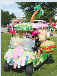
Most Creative 2nd The Brokamp's 36-2