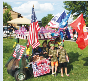
Most Patriotic 2nd The Scoggans 49-1