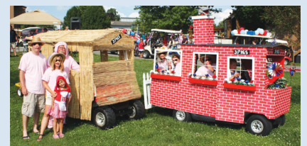
Most Creative 1st The Hughett's 77-4