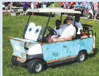
Movie/TV Theme 2nd The Fergusons 99-4