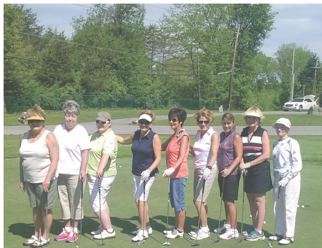
Ladies Golf Camp 2014