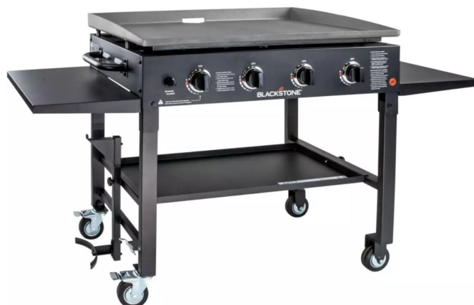
A Gift for the Employee Appreciation Day Drawing

Thank you to all the Woodson Bend employees for all your hard work this year. We appreciate all you do.